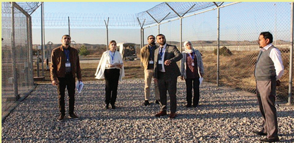
Figure 5: Training at Physical Protection Exterior Laboratory