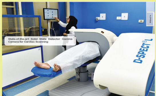
Figure 4 – Operation of Gamma Camera for Cardiac Scanning