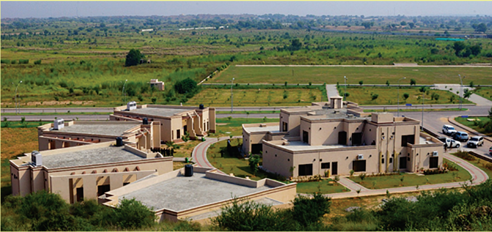
Figure 8 - Pakistan Centre for Nuclear Security (PCENS)