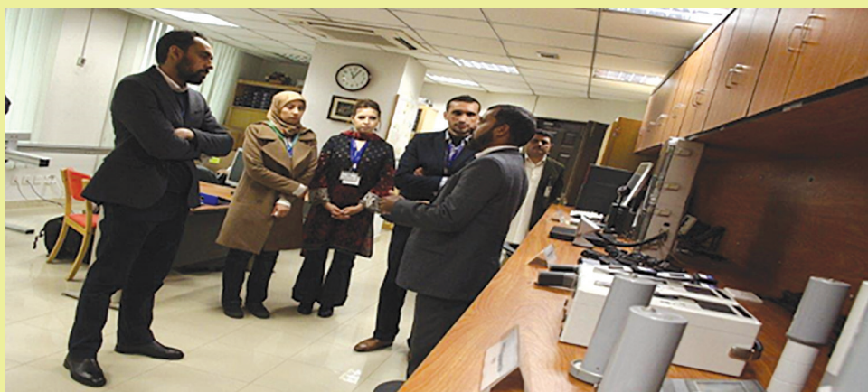
Figure 7 – Training course on Sustainability of Radiation Detection Equipment and expert support capabilities at PNRA