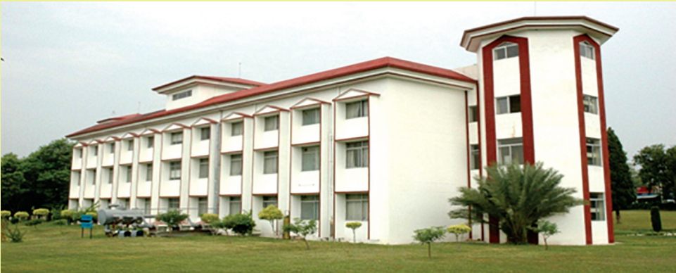
Figure 14- PIEAS