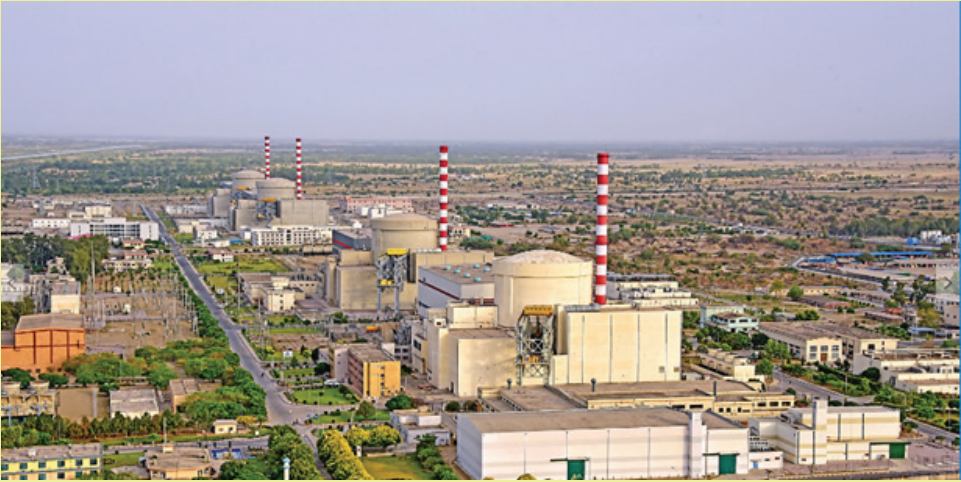
Figure 1 - Chashma Nuclear Power Complex