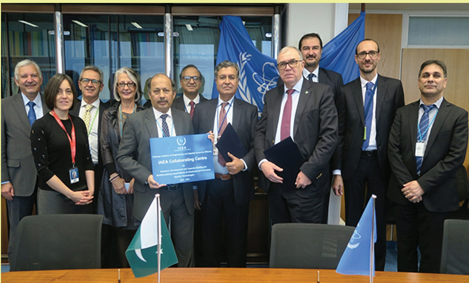
Figure 15 - Ceremony for PIEAS as IAEA Collaborating Centre for assistance in nuclear technologies