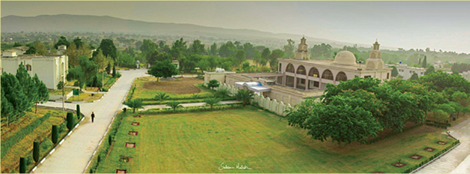
Figure 13 - Pakistan Institute of Engineering and Applied Sciences (PIEAS)