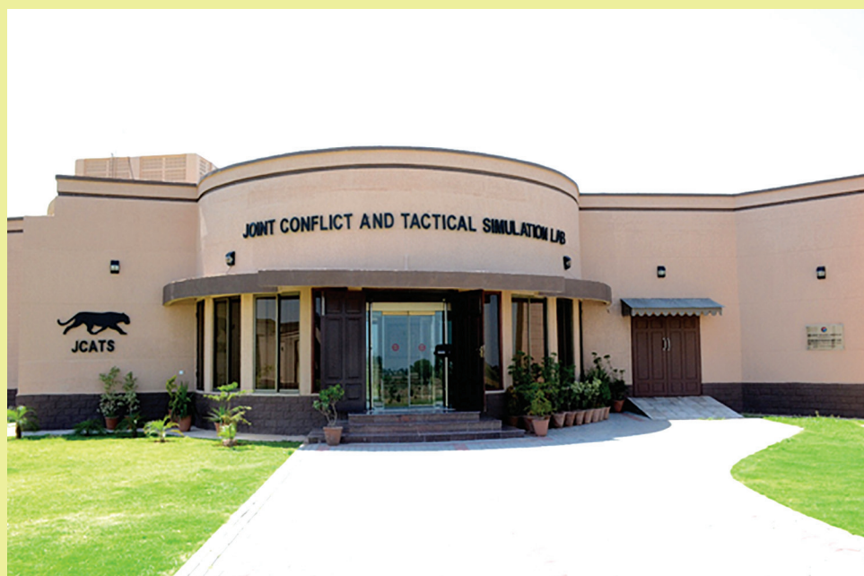
Figure 11 - Joint Conflict and Tactical Simulation Laboratory – PCENS