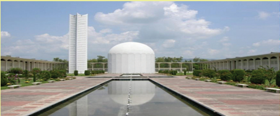
Figure 2 - Pakistan Institute of Nuclear Science and Technology (PINSTECH)