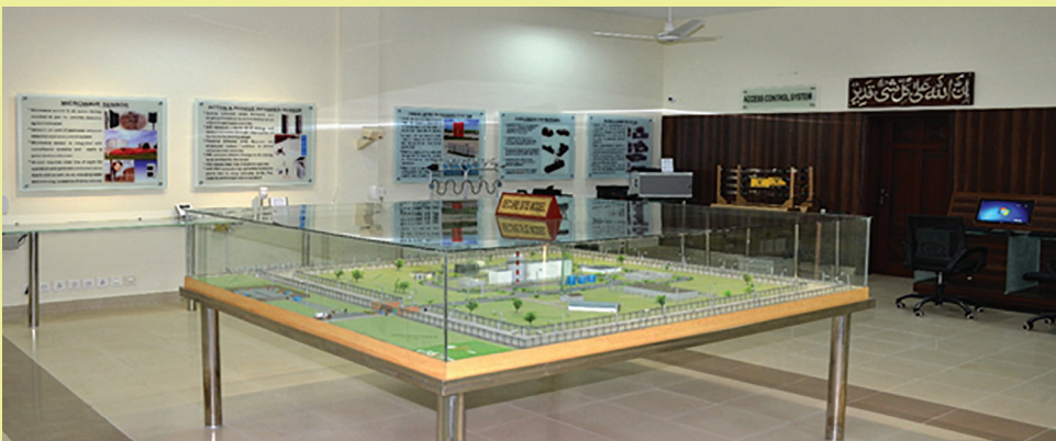
Figure 9- Physical Protection Systems Laboratory – PCENS