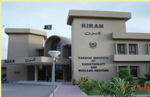
Figure 3 – Nuclear Medical Centre at Karachi