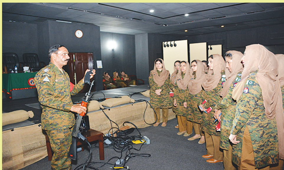
Figure 12 - Training at MEGGITT Weapon Simulator