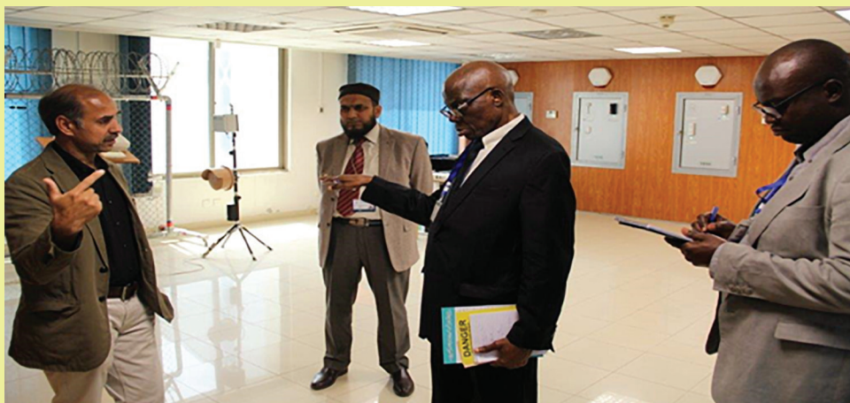
Figure 6 – Nigerian delegation visit to Physical Protection Interior Laboratory (PPEL) at PNRA