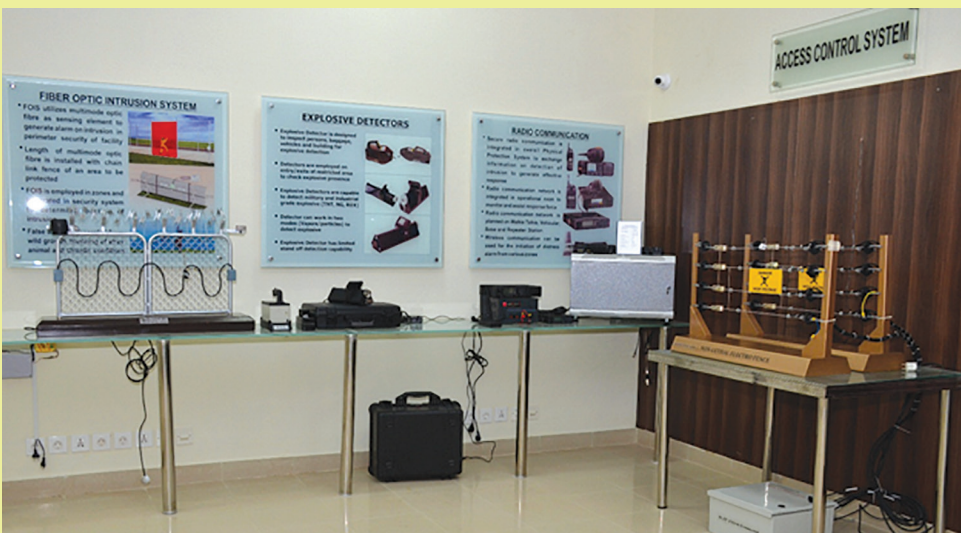
Figure 10 - Physical Protection Systems Laboratory – PCENS